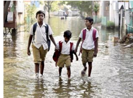
In the online petition, telcos were asked to compensate users as their networks went down and couldn't turn up even after almost five days after rains had halted.

Online platform Change.Org, had in past, run many petitions that recently included 'Save Net Neutrality' campaign that attracted many eyeballs. Nearly 1,000 readers have signed the petition, as per data on the website Tuesday.